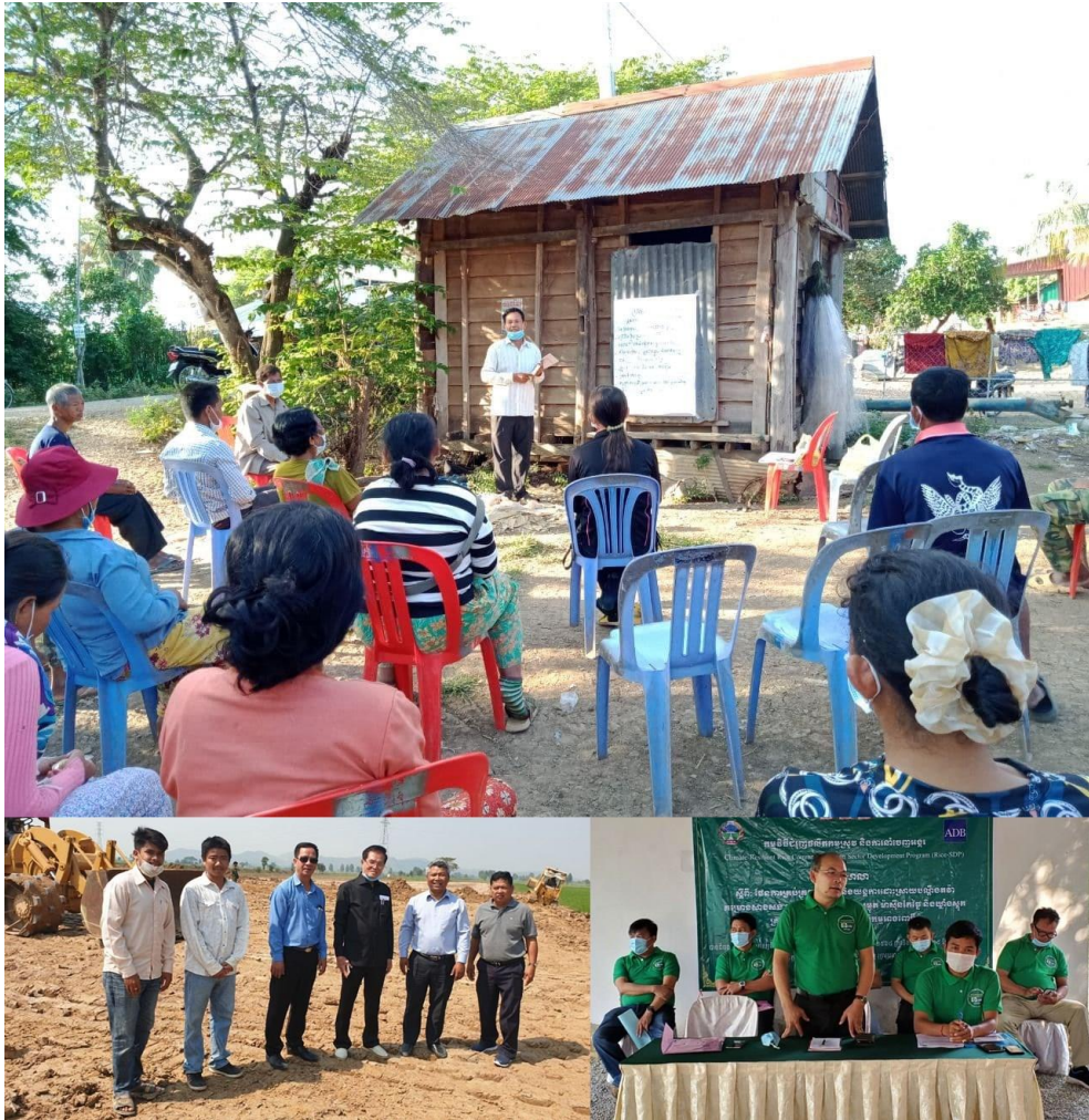
PIO-BTB team visited field training of benefit of land leveling, site construction of rice seed center and CEM, GRM, CEMP workshop.

Provincial Implementation Office, Battambang Province