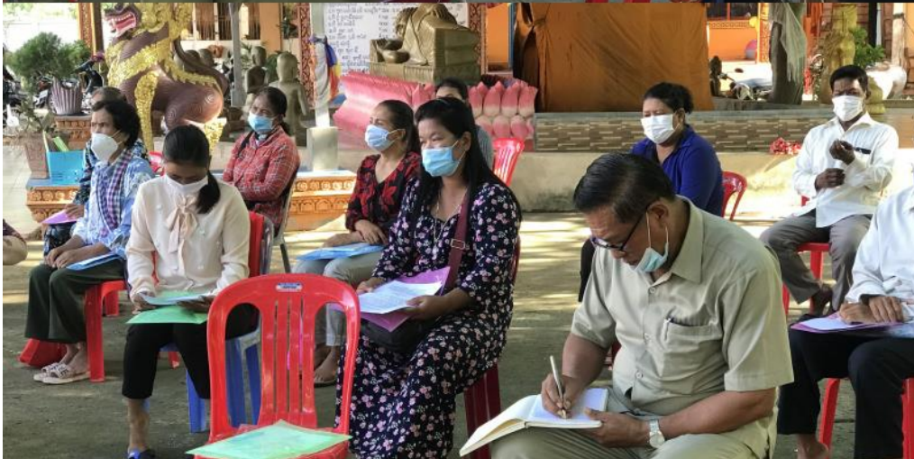
PIO-BTB team visited field training of benefit of land use planning awareness and .

Provincial Implementation Office, Battambang Province