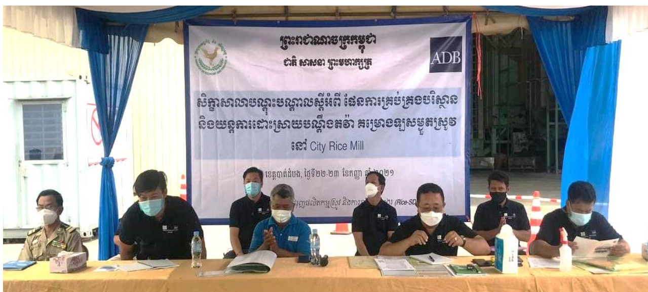
Activity of training workshop on EMP, GRM and CEMP for City Rice Mill in Thma Koul district, Battambang province

Provincial Implementation Office, Battambang Province